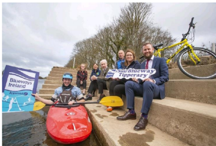
Suir Blueway Tipperary

This accreditation designates our Blueways as best-in-class destinations for water-based and water-side activities.