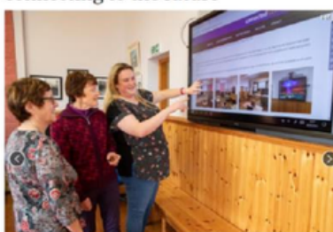
Historical hall in Killurney is connecting to the future

The Tipperary BCP Network - Project Activities Planned for 2022 include;