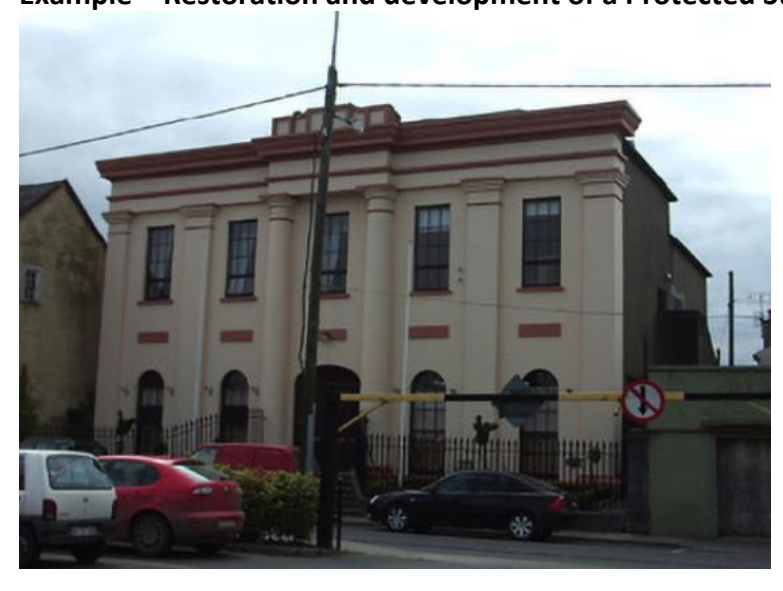
Example – Restoration and development of a Protected Structure