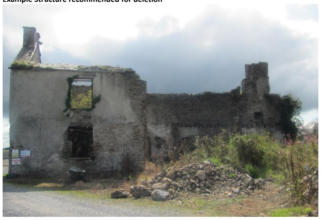
Example Structure recommended for deletion