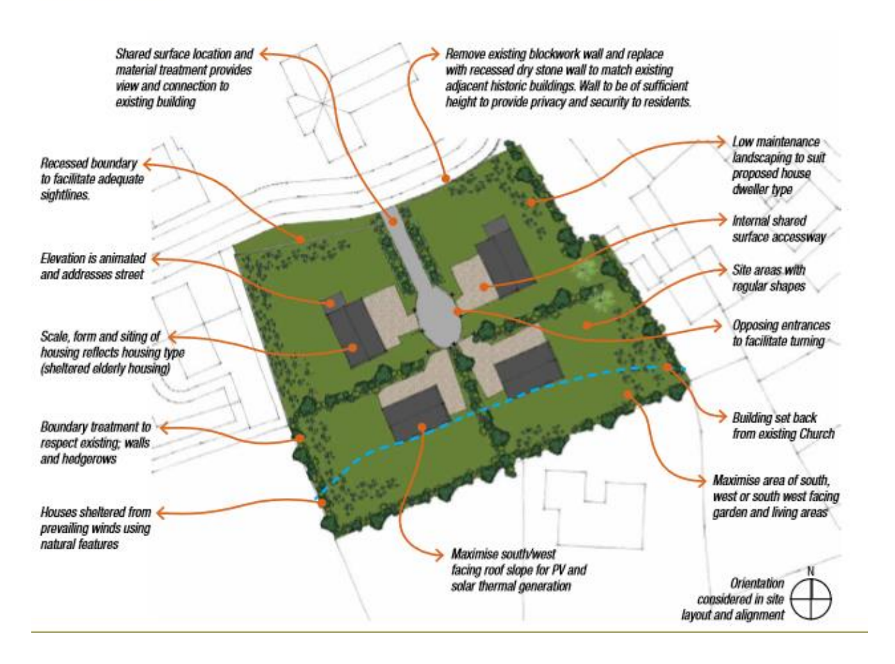
Figure 19: Emly site strategy