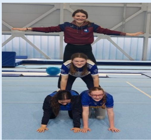
Participants enjoying our recent Boccia Meet Up.

If you are looking for a New Years Resolution Why not join your local Park Run this Saturday and every Saturday morning at 9.30am. In Tipperary there are 5 Parkruns at the following locations Borrisokane Town Park, Clonmel, Fethard Town Park, Knockanacree Woods, and Templemore Park. Parkrun is an inclusive, non-competitive, and enjoyable experience that can have a positive impact on your physical and mental wellbeing. If you haven't previously done a park run register on https://www.parkrun.ie/register/