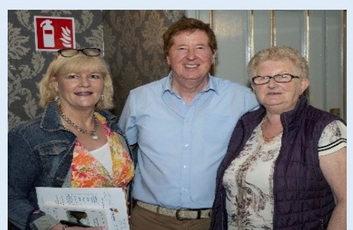
Attendees from various groups around the County