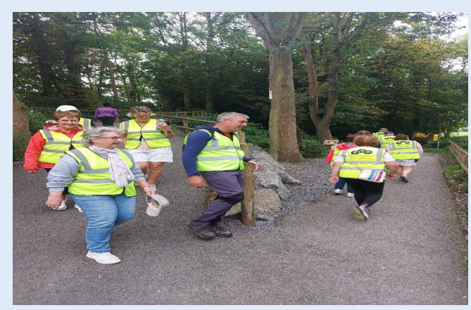
Participants enjoying Let's Get Cahir Walking.

The first of our Autumn 8 week walking programmes has commenced in Cahir. Our second programme will take place in Nenagh and starts on Monday the 7<sup>th</sup> of October at 7.30pm. The walk will be led each week by a qualified walking tutor. The cost of the programme is €10 + online booking fee. https://bit.ly/3rVONZJ