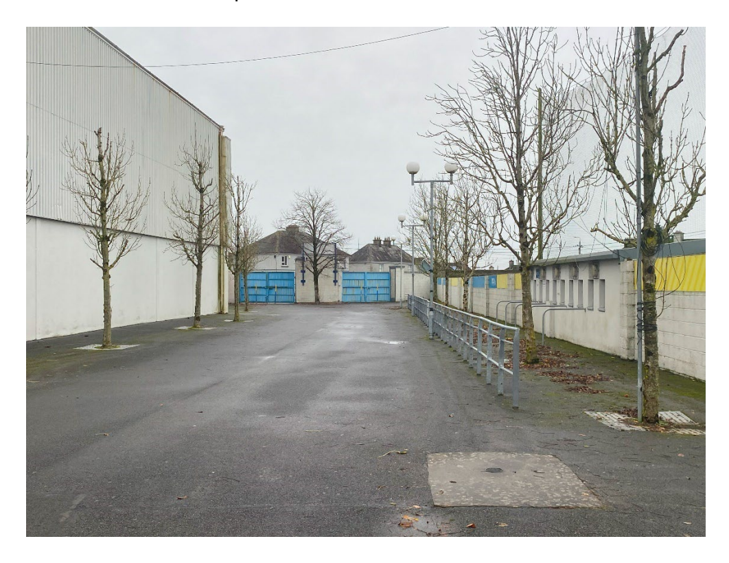
View from inside the stadium