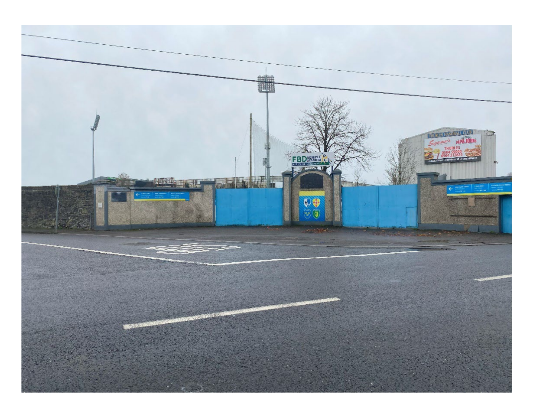
Public entrance to Semple Stadium