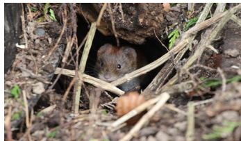
Bank Vole

If you would like to be part of our mailing list please send an email with "Subscribe" in the subject line to: heritage@tipperarycoco.ie Follow us on Facebook and Instagram: Tipperary Heritage Office.