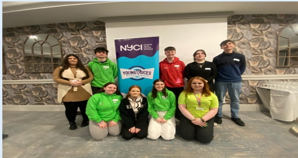
Members of Tipperary Comhairle at the NYCI Youth Voices Event in Cork

The group greatly enjoyed the experience of the day, and the newer members got their first taste into what the impact of their voice can have in Tipperary and wider areas. A huge well done to all of the organising team for a successful event and a further congratulations to all members who attended as they represented themselves and their county very well.