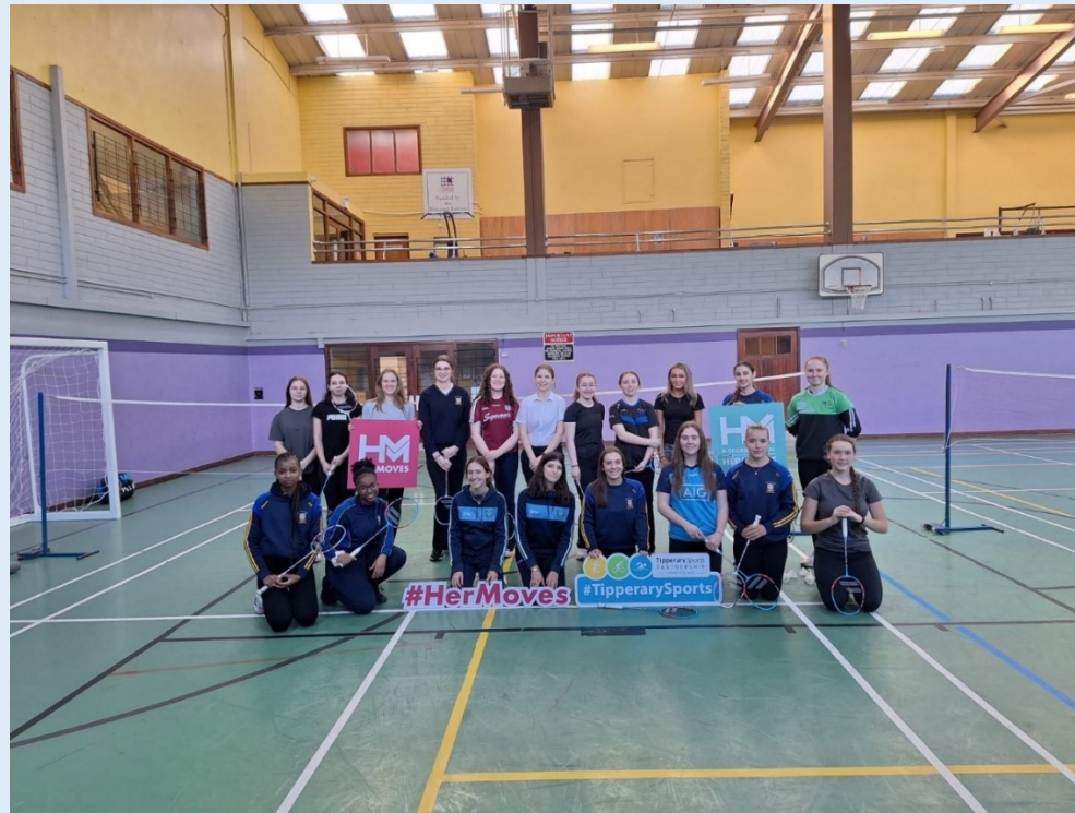
Transition year girls from St. Anne's & St. Ailbe's enjoyed a badminton taster as part of the 'Her Moves' Programme.

The Her Moves programme continues with St. Annes and St. Ailbes in Tipperary Town and the Patrician Presentation Secondary School in Fethard and will form part of Women in Sport Week. The 'Her Moves' campaign is designed to inspire and support more teenage girls to be active. It's about empowering all young women, building confidence and providing motivation to find something that gets you moving!